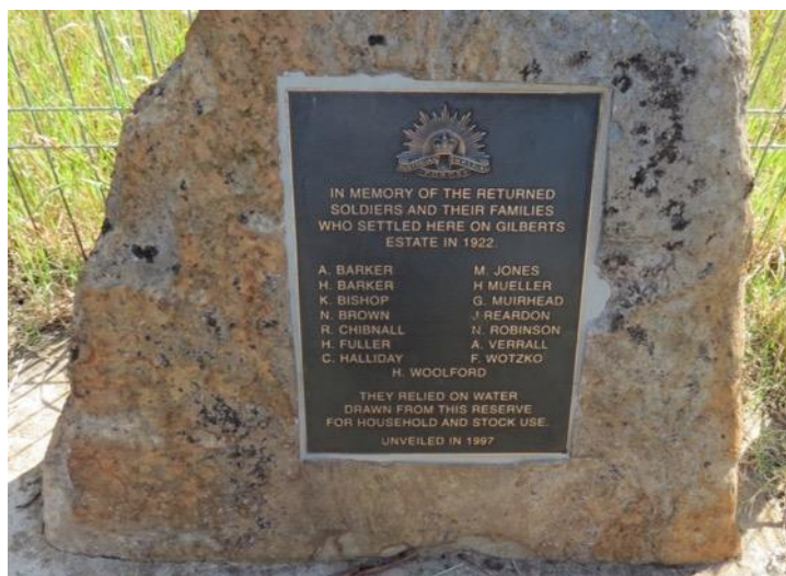
The Rhine Water Reserve Memorial