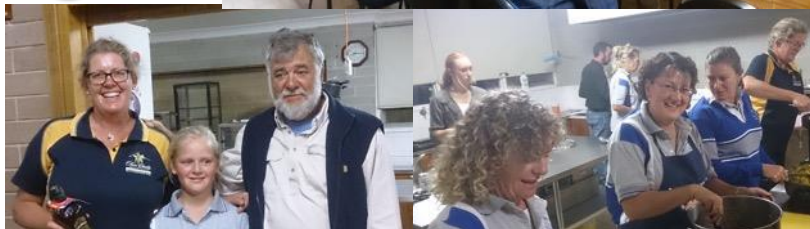
(Above) This month's Community Dinner was catered for by the Pony Club, and the Torrens Valley FC provided the drinks. That new pavilion kitchen is getting closer!