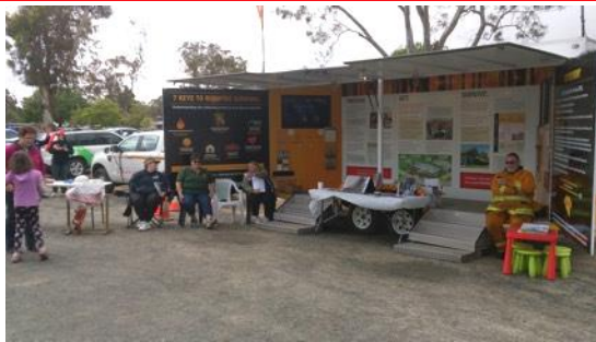
The CFS visited the Market with Smokey to pass on the Bushfire aware message.