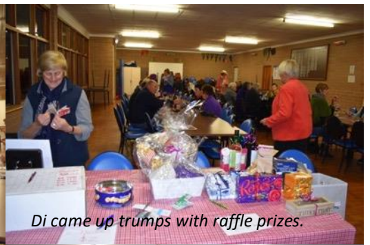
Di came up trumps with raffle prizes.