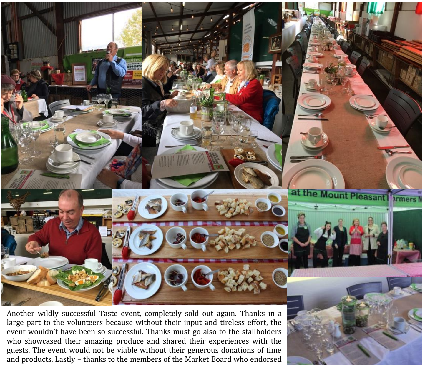
Another wildly successful Taste event, completely sold out again. Thanks in a large part to the volunteers because without their input and tireless effort, the event wouldn't have been so successful. Thanks must go also to the stallholders who showcased their amazing produce and shared their experiences with the guests. The event would not be viable without their generous donations of time and products. Lastly – thanks to the members of the Market Board who endorsed the event and helped in so many ways.