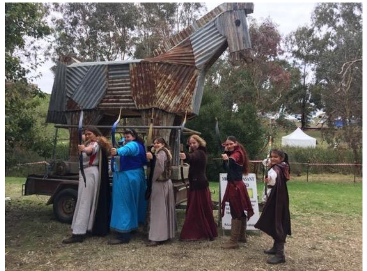
Recognise this? The Trojan Horse (last seen at Twilight Market) was on show at the recent Medieval Fair at Gumeracha, where it proved popular amongst the Archers...