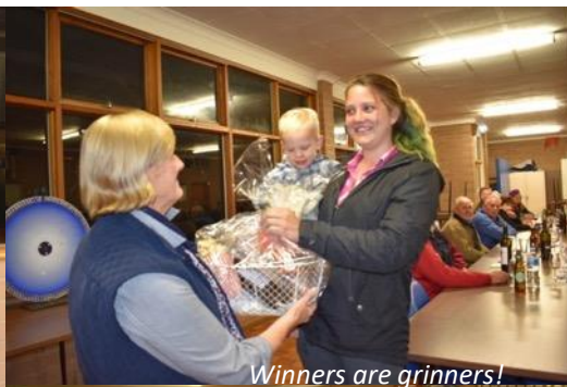
Winners are grinners!