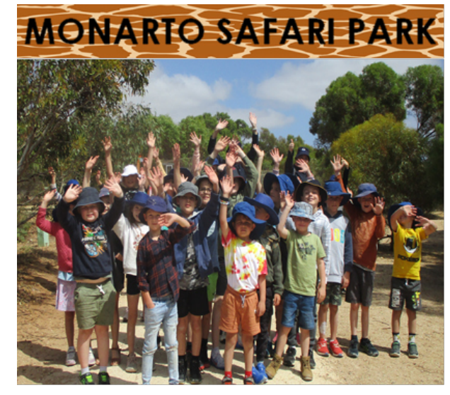
The OSHC children were excited to be out at Monarto over the Christmas break

We had a very successful vacation program with lots of positive feedback from the children. Photo boards are displayed at OSHC & we encourage everyone to come and have a look at the awesome activities that were enjoyed by all. Bounce, Monarto, Roller skating, Adelaide Goal and the Gorge Wildlife Park were the excursions on offer and were a lot of fun. Some of the incursions we had were Tri-skills, Circus Elements and the Marty McBubbles' cool science show. I think the biggest highlight was our Christmas party day and a visit from Santa.