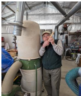
A Scotsman and his bag pipes