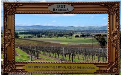
A PORTRAIT OF LYNDOCH · 2024 CALENDAR