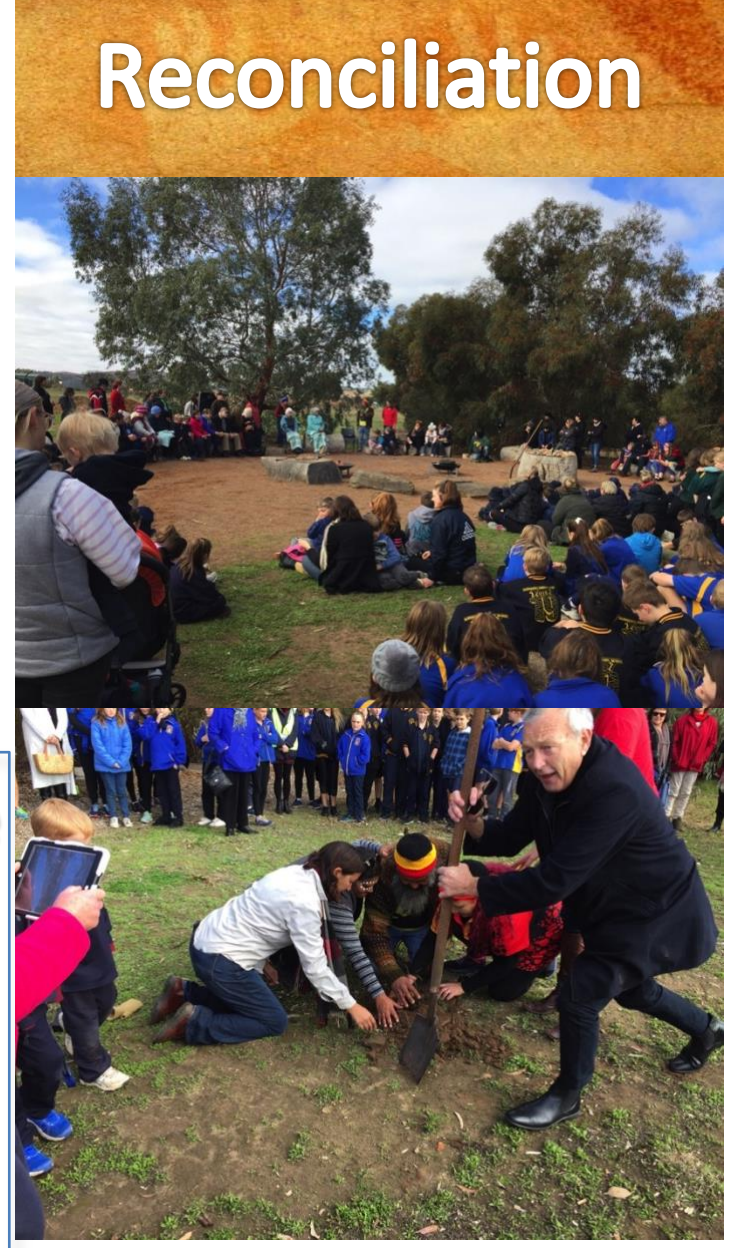
Pictured top: Smoking and Welcome to Country Ceremony at the Bushgarden

Want a gym in Mt Pleasant? Contact MPMS or MP Beat – mtpleasantmensshed@bigpond.com or info@mountpleasant.sa.au