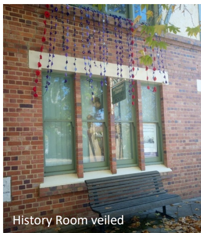
History Room veiled