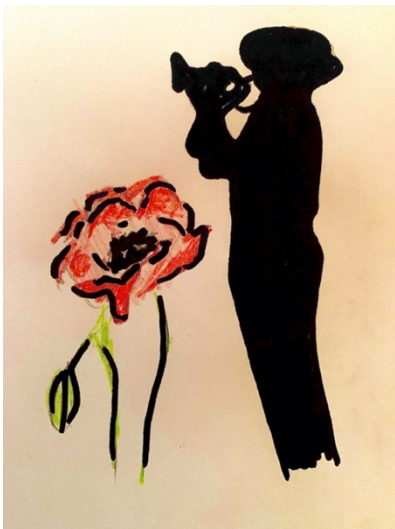
'Anzac Bugler' Illustration by Sarah Hughes