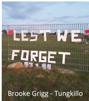
Brooke Grigg - Tungkillo