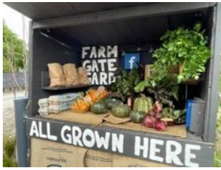
Farm Gate Garden 806 Springton Road, Mt Crawford