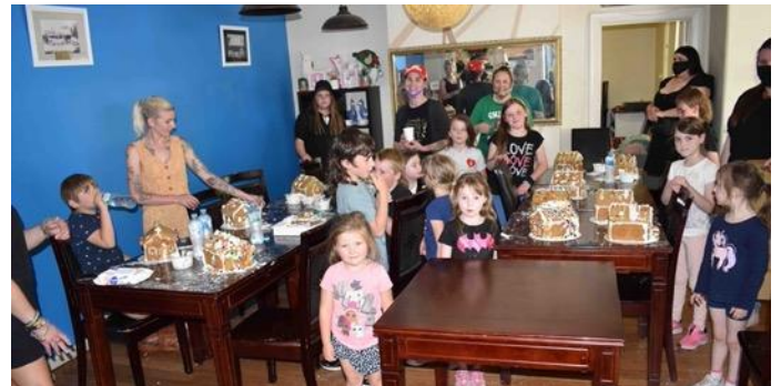
Above: A group of kids ranging in age from very young to young teens who managed to turn out a stack of amazingly decorated Gingerbread Houses.

The management and staff at the MP Bakery have been having fun over the last month or two, starting with Halloween, and moving on to Christmas. Hosting some great Christmas workshops for kids and older, they have really ramped up the atmosphere in town. Good on them!