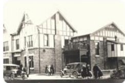
Mount Pleasant District History Group