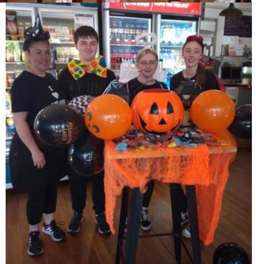
Right are staff getting into the Halloween spirit