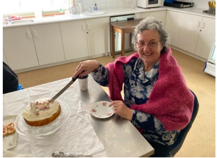
Although she celebrated with family and friends the weekend before, we couldn't resist a little cake and bubbly in the hall.