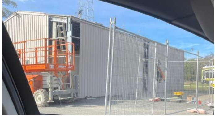
our district. Upgrades

For those of the community who have noticed or heard comings and goings at the station the past couple of days, I would like to let the local community know that work has commenced on some long awaited alterations within the station. The major component being to install ramp and rails and re-structure a couple of areas within the shed to allow for unfettered disabled access.