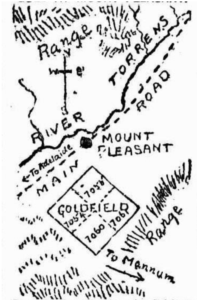
Adelaide Observer (SA: 1843 - 1904), Saturday 5 August 1893, page 20