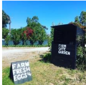
Farm Gate Garden 806 Springton Road,