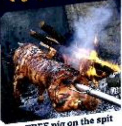
FREE pig on the spit