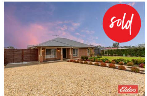
27 Carlisle Street WILLIAMSTOWN