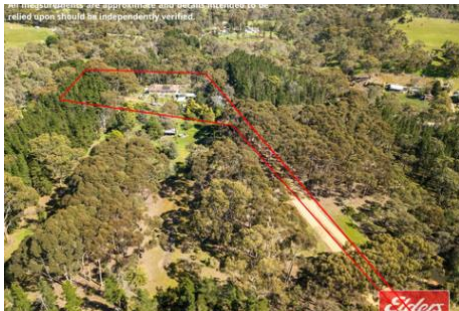
Lot 3 Alexander Murray Road WILLIAMSTOWN