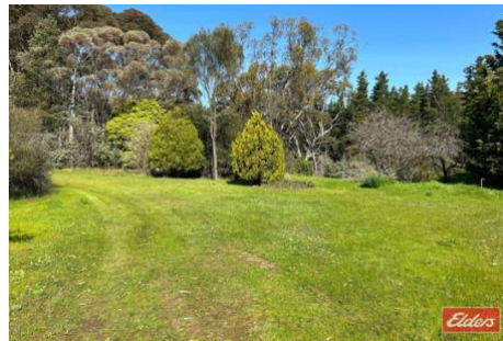
Lot 7 Alexander Murray Road WILLIAMSTOWN