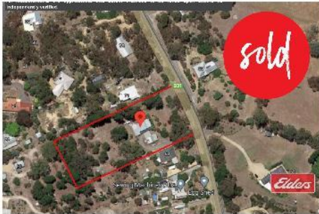
67 Queen Street WILLIAMSTOWN