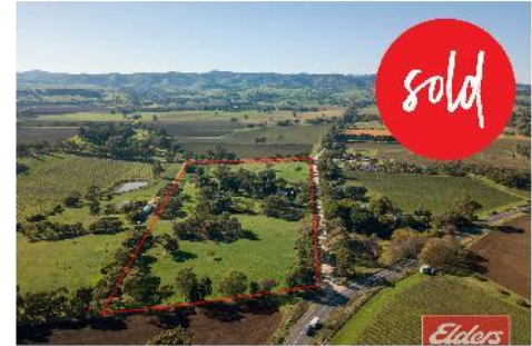
29 Miamba Road LYNDOCH