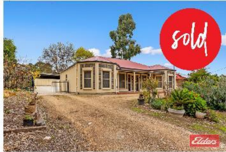
51 Yettie Road WILLIAMSTOWN